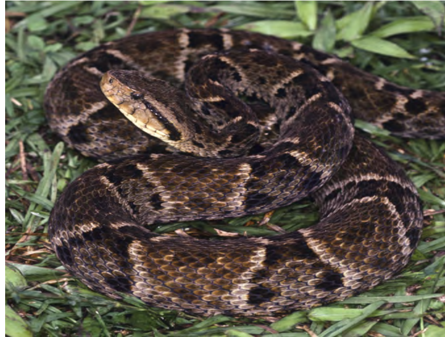
Mapepire balsain (Fer-de-lance)

The easiest way to recognize the four venomous species is to learn their patterns and coloration, much as you do common birds.