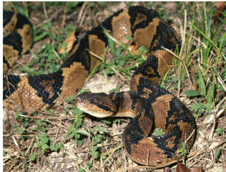
Mapepire zanana (Bushmaster)